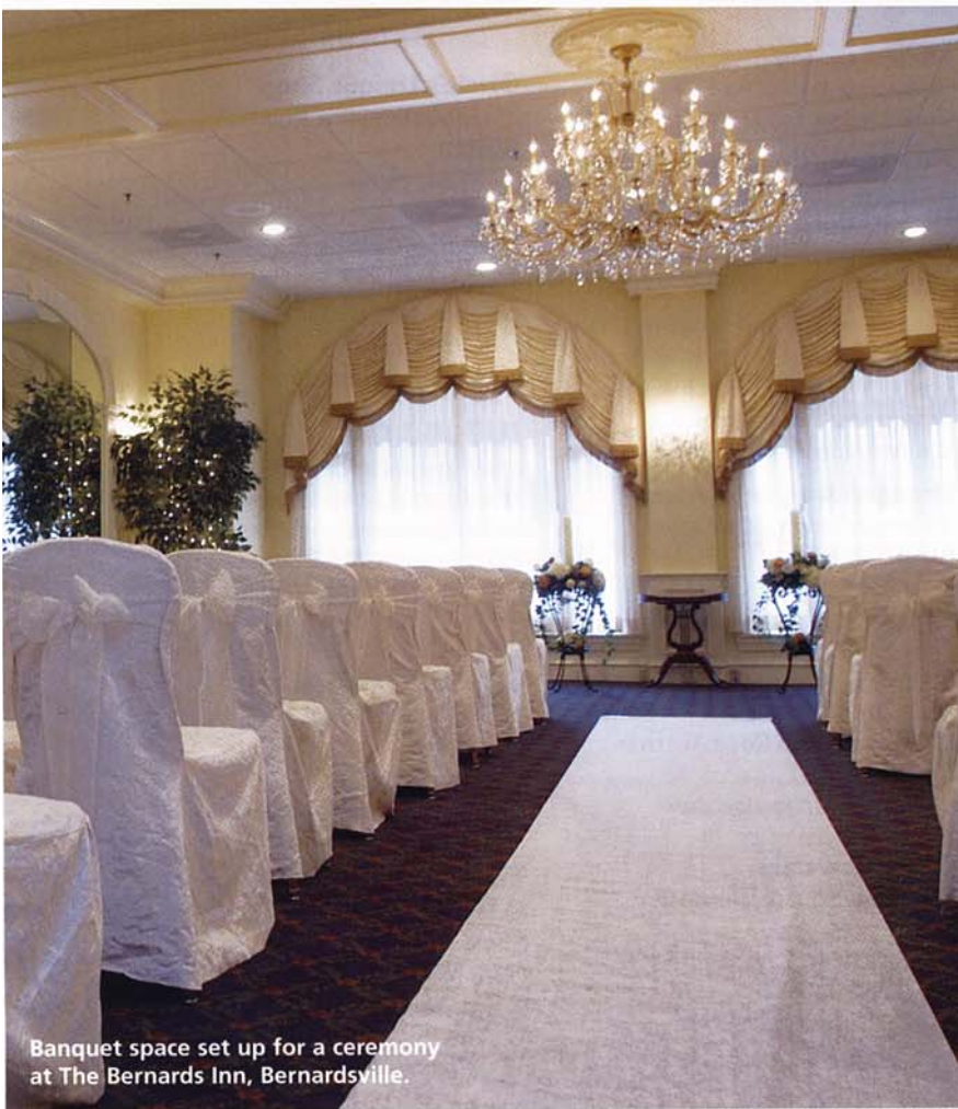
Banquet space set up for a ceremony at The Bernards Inn, Bernardsville.