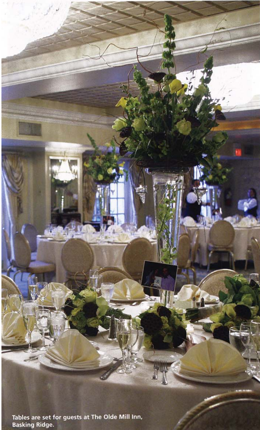
Tables are set for guests at The Olde Mill Inn, Basking Ridge.