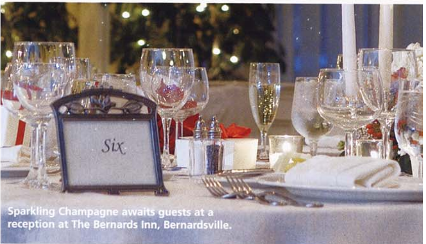
Sparkling Champagne awaits guests at a reception at The Bernards Inn, Bernardsville.