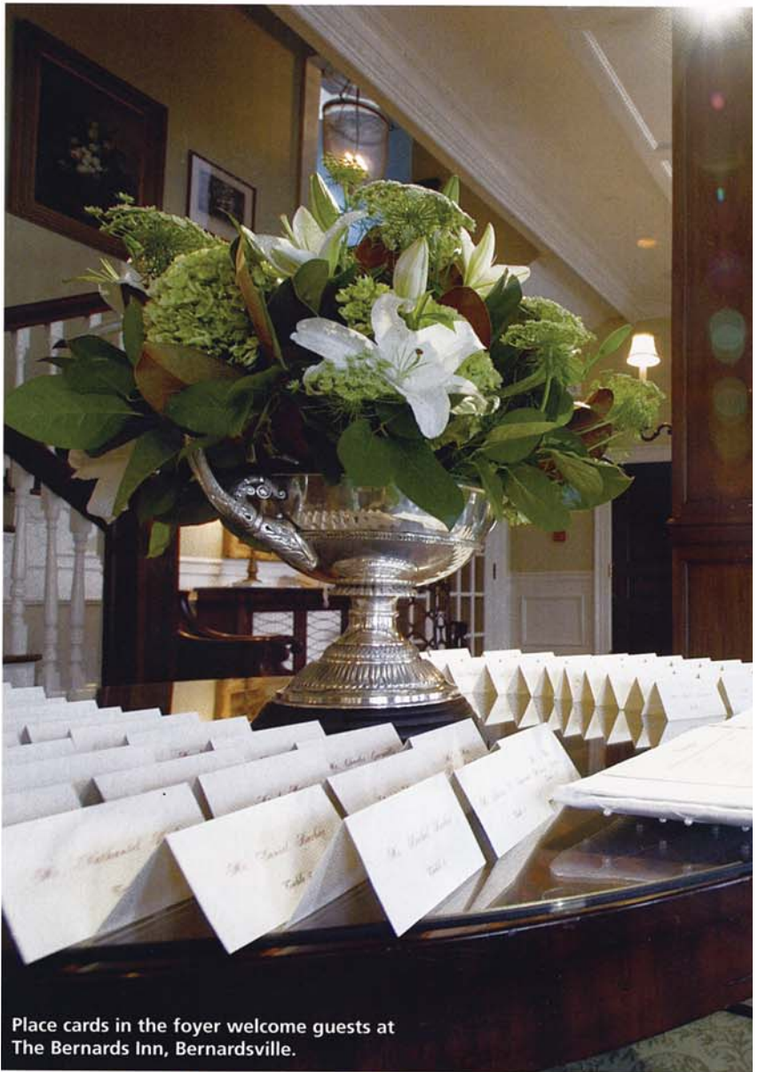
Place cards in the foyer welcome guests at The Bernards Inn, Bernardsville.